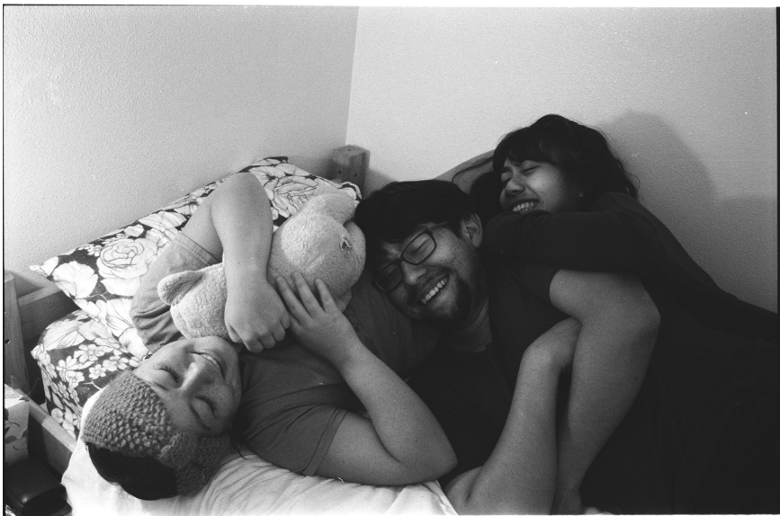
Fig. 6 Post War Comfort

Alternative Titles: The Narnia, The Perfect Earlobe