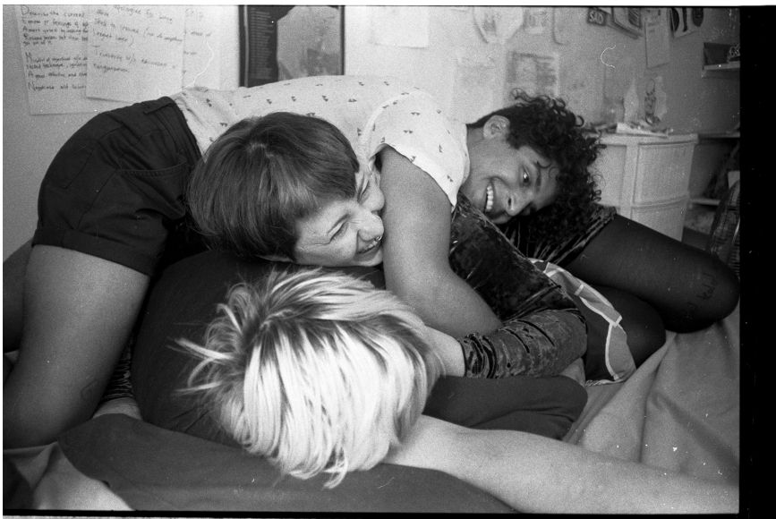
Fig. 8 Unproductive Drunk Cuddle

Alternative Titles: Pile, “I have to pee, I don’t have feeling in my right arm, and I’m sweaty!,” Mt. Everest, Return of the Blob, The Circle of Life, Dirty Laundry