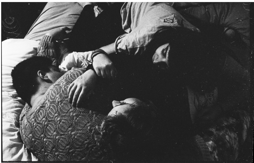
Fig. 7 Cuddle Croissant

Alternative Titles: Love Croissant, Donut ft. no cat, Circle, The Nest