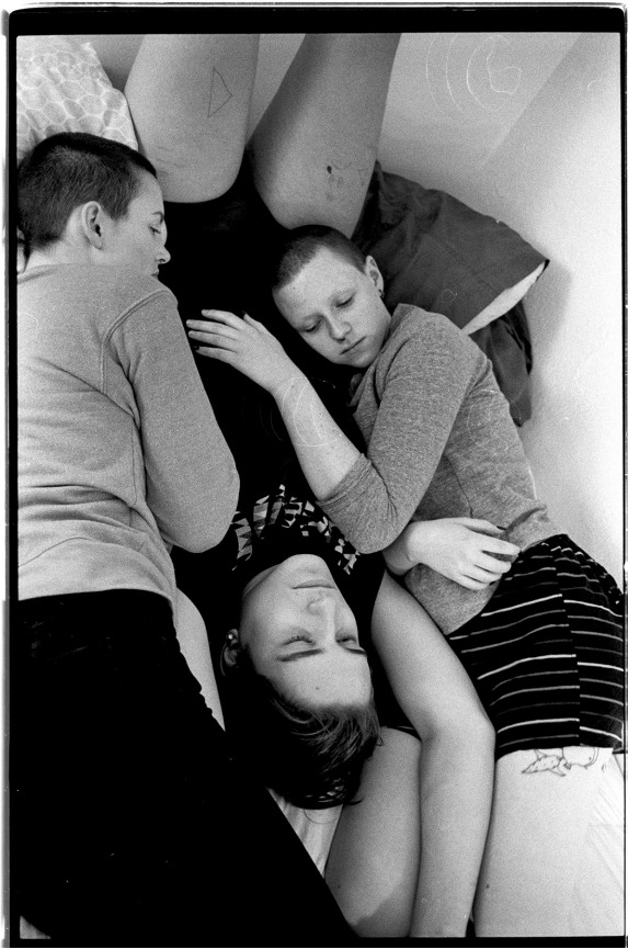
Alternative Titles: The Reverse Jesus