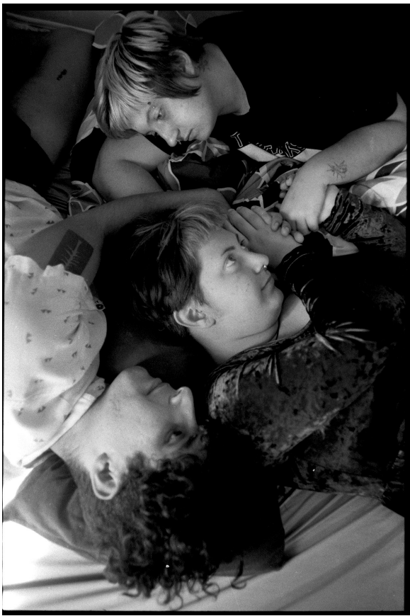
Fig. 11 Non-committal Cuddle

Alternative Titles: Go Team, flop!, the “I Love You,” no touching!, no touch touch, :\\ !