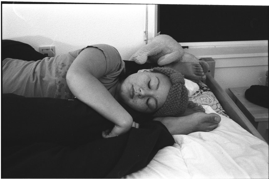
Fig. 10 Mermaid Tail