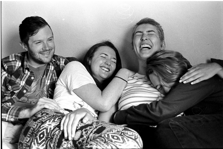
Fig. 3 The 20-20 Sandwich