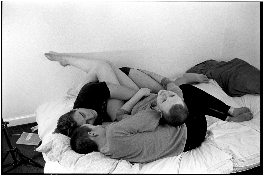
Fig. 2 The Donut Hole